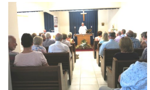
St. Luke's Prodromi