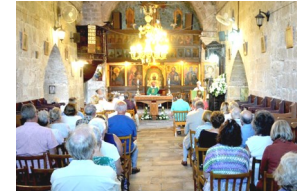
Ayia Kyriaki Kato Paphos