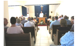
St. Luke's Prodromi