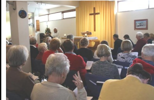
St. Stephen's Tala