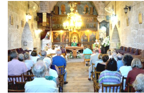
Ayia Kyriaki Kato Paphos