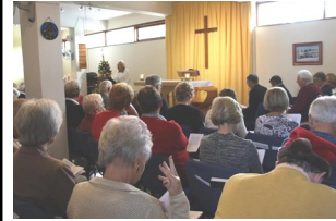
St. Stephen's Tala