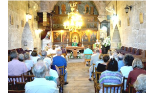
Ayia Kyriaki Kato Paphos