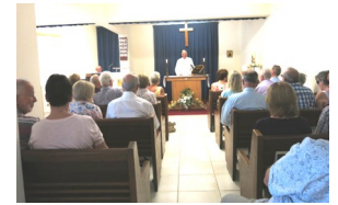
St. Luke's Prodromi