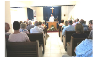
St. Luke's Prodromi