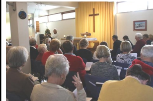
St. Stephen's Tala