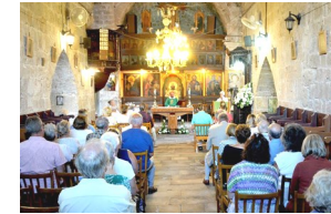
Ayia Kyriaki Kato Paphos