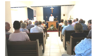
St. Luke's Prodromi