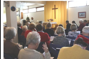
St. Stephen's Tala