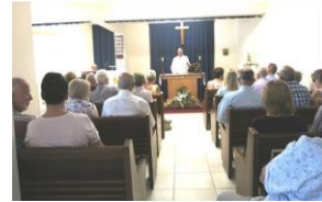
St. Luke's Prodromi