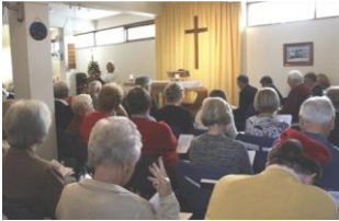
St. Stephen's Tala