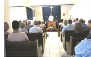
St. Luke's Prodromi