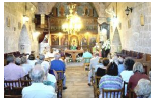
Ayia Kyriaki Kato Paphos