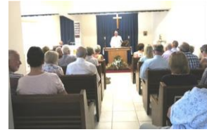
St. Luke's Prodromi