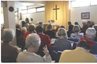
St. Stephen's Tala