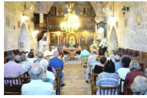
Ayia Kyriaki Kato Paphos